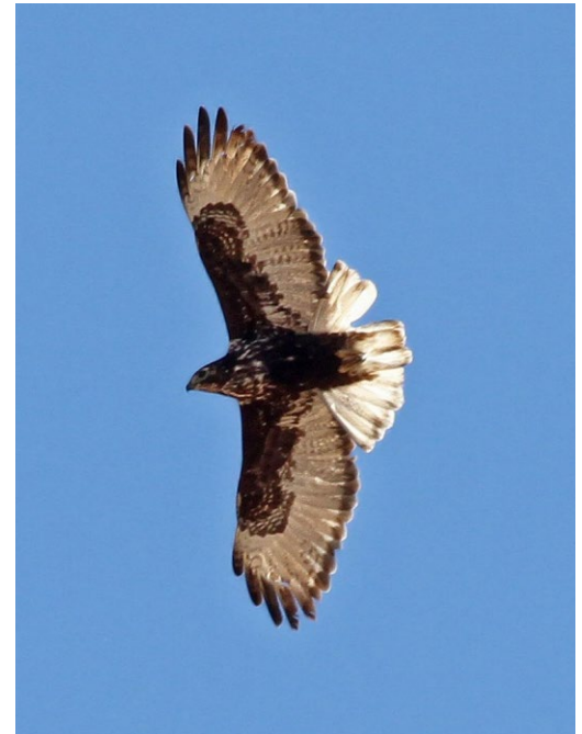
Figure 3. "Harlan's" Red-tailed Hawk, 20 January 2013.

Two subspecies of Merlin are found wintering at the Santa Cruz Flats; the light "prairie" or "Richardson's" ( F. c. richardsonii ) and dark "taiga" or "boreal" ( F. c. columbarius ). Merlins have been reported all but one year (mean = 2.8), with a breakdown of columbarius (mean = 1.7) and richardsonii (mean 1.1).