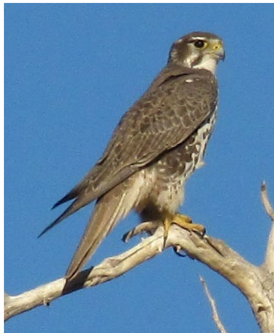
Figure 2. Prairie Falcon, 19 January 2013.

Harris's Hawks were reported in six of the 10 years; with one exception, all of those reports pertained to one or two resident family groups along Cripple Creek Road between Coachway and Baumgartner roads.