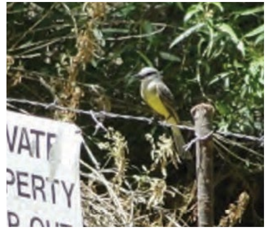
Figure 2: Tropical Kingbird at San Pedro River near San Manuel, 6 June 2011.

Tropical Kingbirds are still found at a few of the previously known outlier sites, such as the San Bernardino National Wildlife Refuge (NWR) in southeastern Cochise County and Hassayampa River Preserve in northwestern Maricopa County. The latter is a well-preserved cottonwood-willow-gallery riparian area where as many as three pairs have been reported (Stevenson and Rosenberg 2006). Tropical Kingbirds, however, are now absent from two sites where they previously nested in northwestern Pima County: the pecan grove south of the Pinal Airpark near Marana and a clump of two large cottonwoods on Hardin Road in Marana. These sites were surveyed by me once each during the 2013 and 2014 nesting seasons, but no Tropical Kingbirds were detected. The abandoned pecan grove was allowed to deteriorate and no longer exists. Although a healthy single row of pecan trees remains on the north side of the former grove, Tropical Kingbirds have not been reported there since 2009 (eBird 2012, AZNM listserv archives). At the Hardin Road site they were reported only in August of 2003 and 2009 (eBird 2012). Another Marana site, the Marana High Plains Effluent Recharge Project, where two kingbirds were reported in August 2009 (eBird 2012), was not visited.