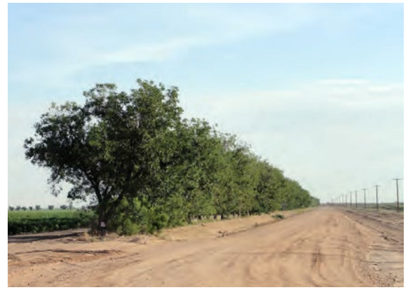
Figure 4: Tropical Kingbird nesting habitat in a single row of pecan trees at Santa Cruz Flats.

Tropical Kingbirds were found by K. Kamper and me along 8.4 km of the 12.9 km contiguous route described above that surrounds two pecan groves and several farm fields. Probable nesting pairs were found on all the roads referred to. In the summer of 2013, Tropical Kingbird pairs, sometimes with young, and in two instances, nests, were discovered along additional roads. These locations are: a 0.4 km dogleg stretch of Baumgartner Road with only four pecan trees 1.6 km to the east of the 12.9 km circuit, a 0.8 km stretch of Tweedy 8 km to the west, and a 1.6 km stretch of Curry 9.7 km to the west (Fig. 5).