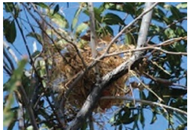
Figure 6: Tropical Kingbird nest in a pecan tree along Tweedy Road at Santa Cruz Flats, 15 July 2013.

Fifty Tropical Kingbirds were detected on 11 August 2014 with a minimum of 15 family groups, although possibly more. It is not clear exactly how many nesting pairs use this area. It can be hard to accurately assess the numbers, because the young and the adults, even though noisy, are often hidden in the upper foliage of the trees. Occasionally, they come down low along the edges of fields to feed, where they are more visible. Of the three nests found, one was along Fast Track Road, one along the Baumgartner Road dogleg to the east of the main concentration, and one along Tweedy Road. All three of the nests observed were in the same height range (11.6-18.2 m) as those reported during the Atlas period (Corman 2005). Typical of the nests of this species, they were shallow, scraggly, untidy, and constructed mostly of grasses and weed stems (Fig. 6).