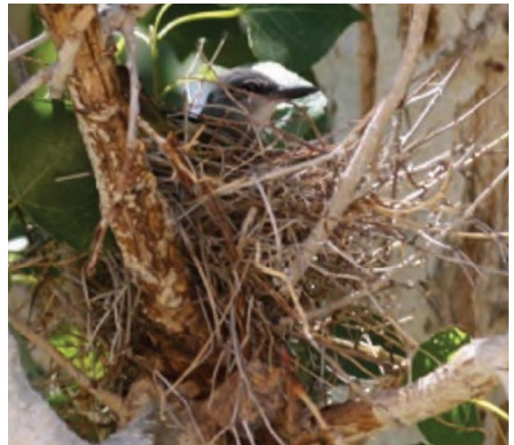
Figure 3: Tropical Kingbird on nest in a cottonwood at 'Ahakhav Tribal Preserve, 1 July 2012.

The most northern and western nesting record for the state is of a pair observed 9 July 2011 building a nest at Pintail Slough, Havasu NWR in Mohave County (AZFO Seasonal Reports 2008). The pair was present during each of the following three years and a nest was observed in 2013 (pers. comm. D. Vander Pluym). Incubation was observed on 20 July 2013 (pers. comm. L. Harter). Both of the lower Colorado River valley pairs have nested in Fremont cottonwoods (pers. comm. D. Vander Pluym).