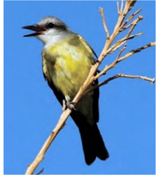
Figure 1: Fledgling Tropical Kingbird, Santa Cruz Flats, 7 August 2013.

From the 1950s to the beginning of the Arizona Breeding Bird Atlas (Atlas) period in the early 1990s, Tropical Kingbirds expanded their nesting range in the state (Phillips et al. 1964, Monson and Phillips 1981). First reported mainly along the Santa Cruz River between Tucson and Nogales, Tropical Kingbirds were discovered nesting at Cook’s Lake between Mammoth and Dudleyville on the lower San Pedro River in 1975 (Monson and Phillips 1981), and by the mid-1980s they had expanded their breeding along the river from Dudleyville to San Manuel (Corman 2005). During this period there were also several reports of nesting away from the Santa Cruz and San Pedro rivers, including along the Salt River east of Phoenix in 1956, the San Bernardino Ranch east of Douglas in 1976, and Arivaca in 1977 (Monson and Phillips 1981).