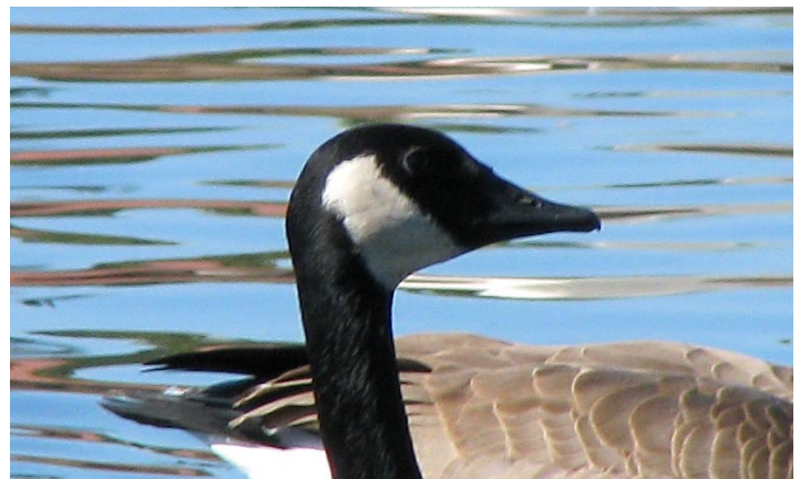
Figure 6. Scottsdale Pavilions, Scottsdale, AZ; 30 Dec. 2007. Detail of the head of the foreground bird shown on Fig. 4. Note that the white cheek patch does not reach the base of the bill.