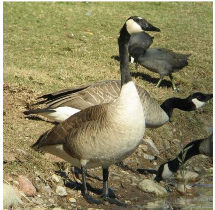
Figure 2. Scottsdale Pavilions, Scottsdale, AZ; 22 Dec. 2007. Giant Canada Goose, B. c. maxima (foreground bird). Note pale breast and large white cheek patch extending to base of bill.