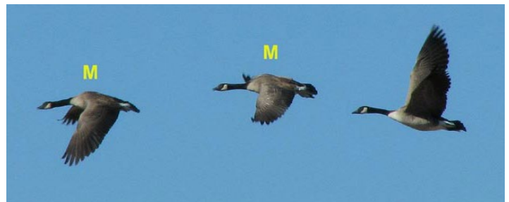
Figure 5. Scottsdale Pavilions, Scottsdale, AZ; 30 Dec. 2007. Same bird as on Fig. 4 in flight with two B. c. moffitti (M). Note large size, long neck, and pale breast.