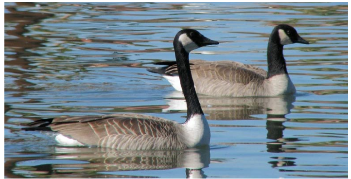
Figure 4. Scottsdale Pavilions, Scottsdale, AZ; 30 Dec. 2007. Large Canada Goose (foreground bird) next to a B. c. moffitti Canada Goose. The foreground bird shows characteristics that are partly consistent with B. c. maxima.