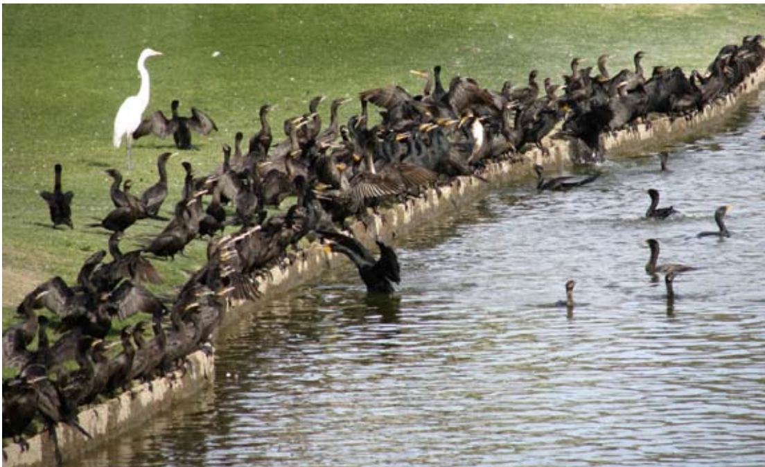
Figure 3. Congregation of about 100 cormorants, mostly Neotropic with several Double-crested Cormorants at Kokopelli Golf Course in Gilbert, AZ.

In Arizona, Neotropic Cormorants prefer fresh water lakes, ponds, lagoons, and slow moving rivers containing large densities of fish with available trees, snags, islands, or open banks for loafing. In Maricopa County the species has become common to locally abundant in some urban lakes and ponds in the greater Phoenix area, as well as along perennial sections of the lower Salt and Gila rivers downstream to Gillespie Dam. Several concentration areas have already exceeded 500 individuals (figure 3). The highest densities have been observed at several residential lakes in Chandler and Gilbert, just upstream of Tempe Town Lake, and several gravel extraction company lakes on the Salt and Gila Rivers. However, it should be noted that the specific concentration locations are often temporary and are based on abundant populations of appropriate size fish. Once prey populations are reduced, these highly mobile cormorants readily move to other neighborhood lakes and ponds.