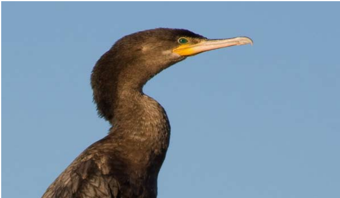
Figure 4. On this juvenile Neotropic Cormorant the yellow orange gular pouch is similar in color to that of a typical Double-crested Cormorant, but note the color and feathering of the supra-loral and the dark breast.

The identification of juveniles of both species can be challenging. These birds share many of the differences noted above for adults, especially the shape of the gular pouch and differences in the supra-loral. Juveniles of both species are lighter and browner than adults. Juvenile Neotropics are usually a fairly uniform dark brown with at most only slightly paler underparts. Juvenile Double-crested usually have light gray breasts which are sometimes paler gray on the upper breast, neck, and throat. Some juvenile Neotropics are especially challenging because they may have facial skin color that is brighter than adults (Clark 1992) and, therefore, more closely approach Double-crested. A key feature in separating these juveniles is the supra-loral which is dark feathering in Neotropics, but is fairly bright orange-yellow or yellow-orange bare skin and uniform in color with the gular pouch in Double-crested (figures 4 & 5; Patten 1993).