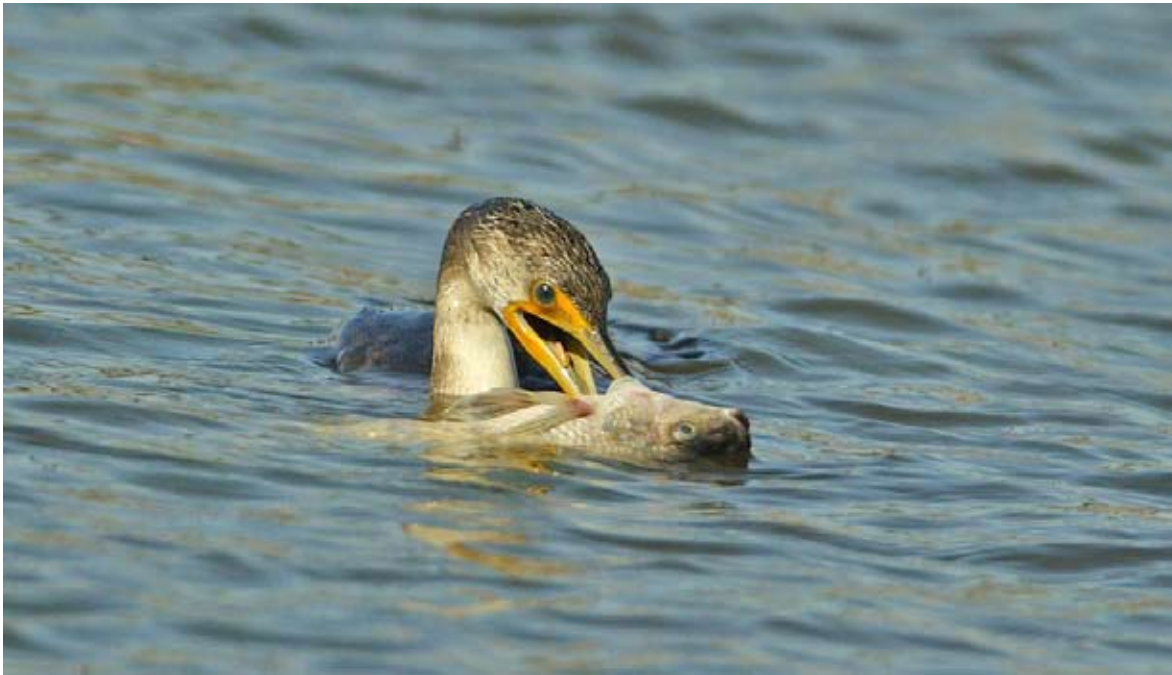
Figure 5. On this juvenile Double-crested Cormorant note the bare skin and color of the supra-loral and the pale throat and upper breast.