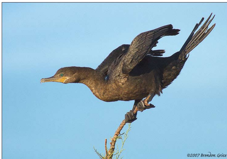
Figure 1. Adult Neotropic Cormorant, Gilbert, AZ.

The Neotropic Cormorant ( Phalacrocorax brasilianus ) is suitably named given it is the only cormorant ranging over the entire neotropics. Although it is widespread throughout most of the western hemisphere, in the U.S. it is found primarily along the Gulf States of Texas and Louisiana, north locally to Kansas, and in south-central New Mexico. The species is sedentary throughout most of their breeding range, with widespread post breeding dispersal (figure 1).