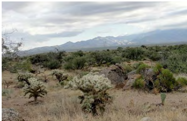
Figure 2: Area in Pinal Co. where Cassin's Sparrows were found singing and skylarking 2006-11.

Phillips et al. (1964) include a map that includes sites of wintering Cassin's Sparrow in the Willow Springs Road-Oracle area, but there are no documented reports during breeding season. The surveys during the Arizona Breeding Bird Atlas between 1993 and 2000 in that area didn't detect any Cassin's Sparrows, but these surveys were conducted in April and May before typical singing and other breeding behavior for this sparrow begins (Troy Corman, correspondence to the author, 12 July 2012).