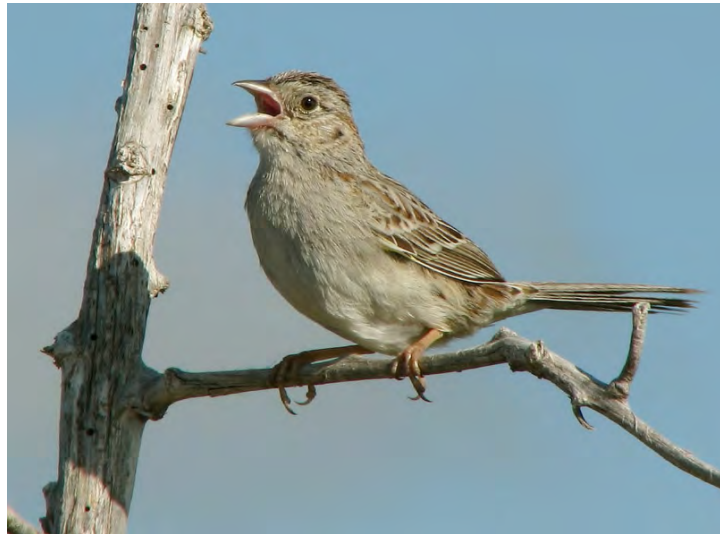
Figure 1: Singing male Cassin's Sparrow, Comanche National Grassland, Colorado.

Most breeding bird surveys in Arizona are conducted in the late spring and early summer when most birds that breed in the state are expected to be nesting. However, this opens the possibility of missing species that typically breed in response to the onset of monsoon rains in July. One of these overlooked species is the Cassin's Sparrow ( Peucaea cassinii ; Fig. 1). This may have been the case in Pinal County, where there was no recent evidence of even possible nesting for Cassin's Sparrow before 2000 (Corman 2005). Following an especially wet monsoon season in 2006, Cassin's Sparrows were discovered singing and skylarking in an extensive semidesert grassland area from Oro Valley in northern Pima County to east of Oracle in Pinal County (Fig. 2). The skylarking behavior of singing males in July and August suggested the presence of females and probable nesting (Dunning et al. 1999) 1 . Surveys by the author that summer documented an extensive area where breeding behavior was detected (Jenness 2008).