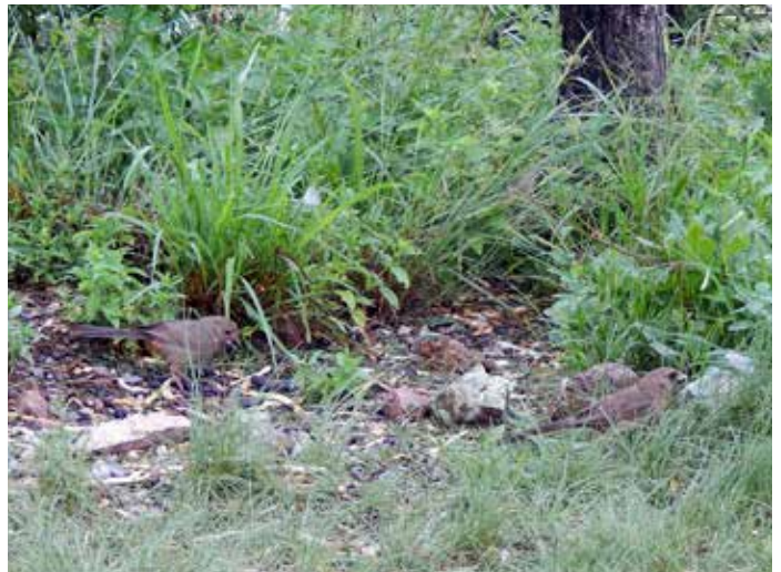
Figure 4. Foraging mixed pair of Canyon and Abert's towhees, near feeder. TimBuckTwo, Pima County, Arizona. 10 August 2015.

On 8 April, I noticed sunshine on the incubating female's head, and when she left the box, I checked it and the cover had come off. I felt inside the nest and found two warm eggs. I replaced the cover but didn't secure it. The female returned to the nest box, climbing through the hole, and continued to incubate. On 11 April, the cover came off again, and again I replaced it. The female's tail became very ragged from being in the nest box, and the box's ceiling may have damaged her crown feathers.