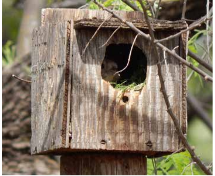
Figure 3. Female Canyon Towhee sitting on nest in nest box, near Papalote Wash. TimBuckTwo, Pima County, Arizona. 4 April 2015.

Often the male Abert's Towhee came to the feeder by himself, but when the female Canyon Towhee was present, he was there too, presumably mate guarding (Figure 4). Also, when I approached the nest box, I heard the Abert's Towhee give an alarm "pipping call" from a nearby hackberry tree. The pair kept in contact with each other by contact notes, and they also performed a squeal duet as they came together after being separated (Marshall 1964).