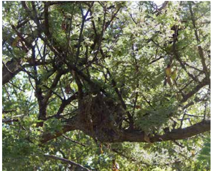
Figure 7. Canyon Towhee's second nest on branch of catclaw acacia, Senegalia greggii , at the confluence of Swashbuckler and Papalote washes. TimBuckTwo, Pima County, Arizona. 22 July 2015.