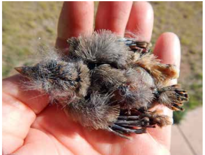
Figure 5. Dead nestling from nest box, dorsal view: Canyon x Abert's Towhee. TimBuckTwo, Pima County, Arizona. 27 April 2015.

On 27 April, a different pair of Canyon Towhees at the other end of our property had young fledge from their nest, so I checked the mixed-pair's nest box and found a dead nestling and an unhatched egg with a tiny hole and a small amount of dried yolk in it. Counting days from the estimated hatching date and from the nestling's plumage, it appeared to be near fledging. I photographed the nestling, collected it, and later deposited it in the University of Arizona Bird Collection (Figure 5), where it is available for genetic testing to confirm hybridization.