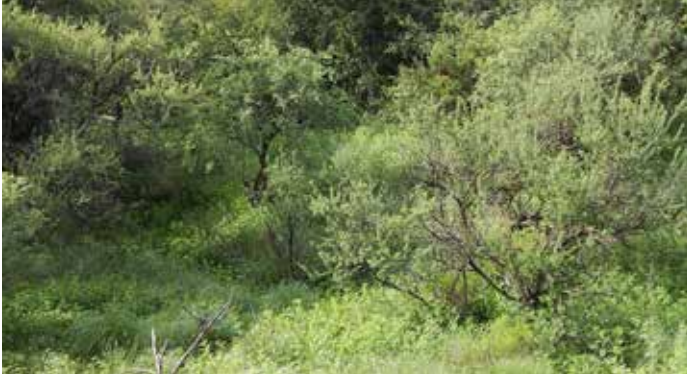
Figure 8. Habitat and large netleaf hackberry ( Celtis reticulata ) tree (center), where Canyon Towhee built third nest adjacent to Papalote Wash. TimBuckTwo, Pima County, Arizona. 20 July 2015.

On 19 July, I found the third nest of the mixed pair by following a Canyon Towhee that was carrying food. The nest was about 6 m up in a large netleaf hackberry tree near the confluence of Papalote and Swashbuckler washes (Figures 8 and 9). I watched the nest from the opposite hillside and saw another Canyon Towhee bring food to the nest. A short time later, an Abert's Towhee brought food to the nest. These Canyon Towhees represented two different individuals because the female Canyon Towhee had distinctive crown feathers, and the time gap between food deliveries was too short for one bird to have delivered food and then collected more food for a second delivery. Through binoculars, it appeared that the additional Canyon Towhee had an enlarged cloacal protuberance, characteristic of a male.