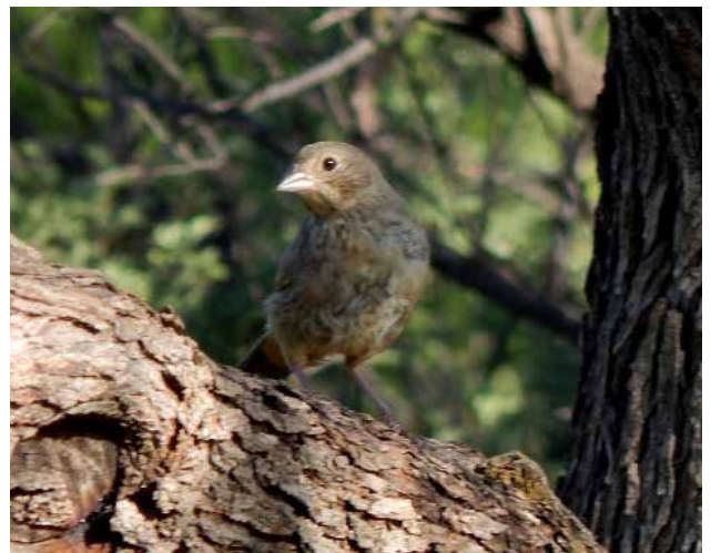
Figure 10. Mixed Canyon x Abert's towhees' large fledgling. Near seed feeder. TimBuckTwo, Pima County, Arizona. 29 August 2015.

On 29 August, the mixed pair brought a fledgling to the feeder area, and I photographed the large fledgling (Figure 10). Although the photo doesn't clearly show many identifiable characteristics, this fledgling doesn't appear to have the black in its face characteristic of Abert's Towhees. It looks more like a Canyon Towhee. The female and the fledgling exchanged call notes, and the male Abert's Towhee was silent. The three birds flew away together.