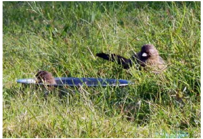
Figure 11. Juvenile towhee hybrid bathing in dog water dish near edge of agility field. Adult male Abert’s Towhee is to the right. TimBuckTwo, Pima County, Arizona. 11 October 2015.

On 11 October, I noted that the family of towhees was still together—there were at least two juveniles with the female Canyon Towhee and the male Abert’s Towhee. The family flew around the territory, going to many different areas including the edge of an agility field, where they bathed in a dog watering bowl. I could see that the young were replacing their rectrices. I snapped photos, getting one of a fledgling in the bowl with the adult Abert’s Towhee nearby (Figure 11). The fledgling appears to have black forehead feathers like the one observed in September. The evidence appears to show that one fledgling resembled a Canyon Towhee and its sibling looked more like an Abert’s Towhee.