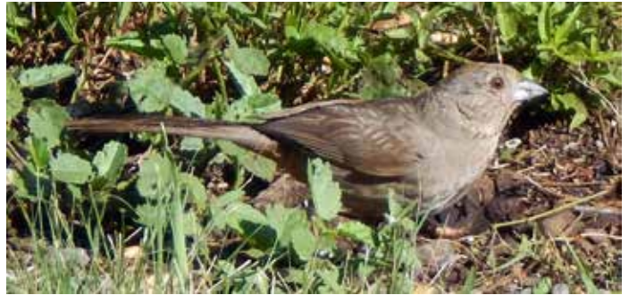
Figure 1. Female Canyon Towhee. TimBuckTwo, Pima County, Arizona. Careful inspection reveals a "crease" in the crown feathers. 23 August 2015.

Since moving to TimBuckTwo in winter 2003, I have kept records of all my bird observations in a journal, and it wasn't until 2008 that I observed an Abert's Towhee here (Table 1). Once I realized that a female Canyon Towhee and a male Abert's Towhee were paired in 2015, I watched them closely with Swarovski 8x20 binoculars as the season progressed, looking for signs of nesting, and took photographs with a Nikon camera with a Zoom-Nikkor 70-300mm f/4-5.6D ED AF lens. After a nest was located, I kept my distance to minimize disturbance. Therefore, I did not count provisioning trips. After her first nesting attempt, I could identify the female Canyon Towhee by the unique shape of her crown feathers, which appeared to have been damaged, making a "crease" shape in the crown, which is most evident in a lateral view (Figure 1).