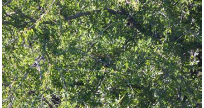
Figure 9. Canyon Towhee's third nest on branch, center, within netleaf hackberry, Celtis reticulata , adjacent to Papalote Wash. TimBuckTwo, Pima County, Arizona. 22 July 2015.

On 22 July at 0758, a Canyon Towhee went to the nest, where I observed at least two nestlings. At 0801, I watched as an Abert's Towhee came to feed the nestlings. At 0824, two Canyon Towhees were at the nest feeding nestlings; then three minutes later, an Abert's Towhee brought food to the nest. I was unable to document this with photographs.