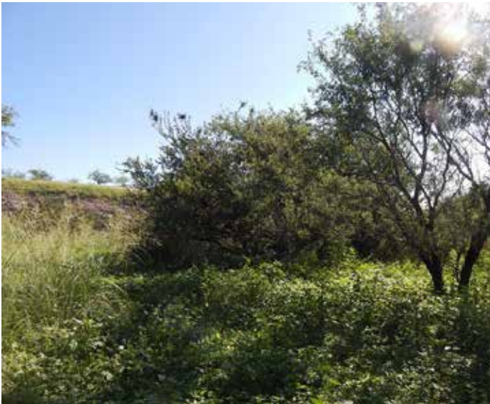
Figure 6. Habitat and small catclaw acacia, Senegalia greggii (center), where Canyon Towhee built second nest. Confluence of Swashbuckler and Papalote washes. TimBuckTwo, Pima County, Arizona. 22 July 2015.

The mixed pair of towhees remained together, and I discovered their second nest on 9 May, about 1.83 m up in a large catclaw acacia tree (Figures 6 and 7). The pair silently approached me as I looked inside the nest with a mirror and saw one towhee egg. On 11 May and 22 May, two towhee eggs were present, and on 24 May, there were two recently hatched nestlings. I stayed away from the nest, and on 5 June, I heard the male Abert's Towhee resume singing. As I still had not seen the pair feeding any nestlings or fledglings, even though the pair still came to the feeder and foraged together within their territory, I concluded that the nesting had failed.