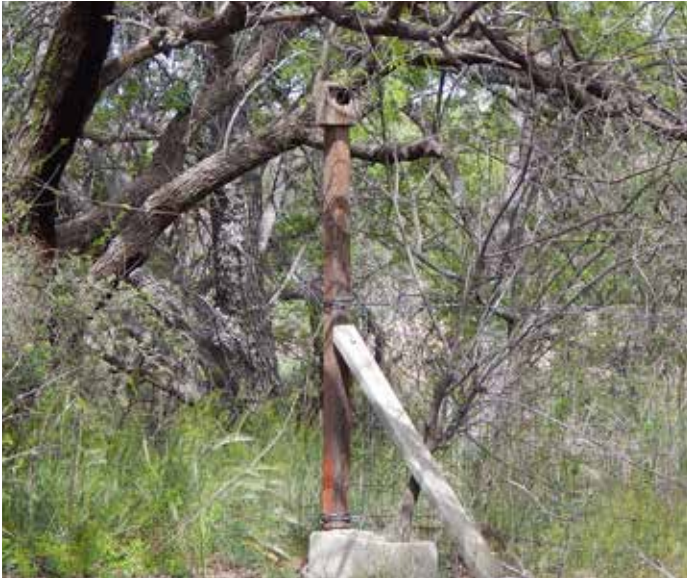
Figure 2. Nest box on fence post, near Papalote Wash. TimBuckTwo, Pima County, Arizona. 4 April 2015.

On 30 March, I observed a Canyon Towhee with nest material, and on 31 March, I watched as a Canyon Towhee brought pieces of gray-colored grass stems to a finch nest box that was mounted 1.5 m above ground on top of a wooden fence post at the edge of the riparian vegetation along Papalote Wash (Figure 2). The outside dimensions of the wooden nest box are 12.7 cm height x 12.7 cm length x 12.7 cm width. The inside dimensions are 11.23 cm height x 11.43 cm length x 11.43 cm width, and the top is covered with a similar-sized piece of wood that lifts upward, hinged loosely in the back with two brads. The circular entrance hole, facing east, is 5.08 cm in diameter, 5.08 cm from the bottom of the box. The Canyon Towhee finished nest building and began incubation (Figure 3).