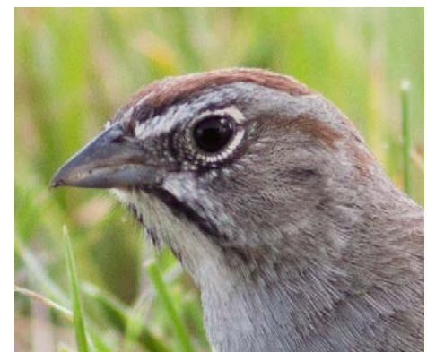
Figure 1. A Rufous-crowned Sparrow with relatively finer markings and an eye-ring usually only broken by the post-ocular stripe.