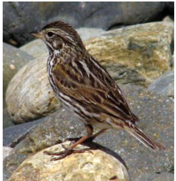
Figure 3. The Belding Sparrow is promoted to full species status in the reference guide.