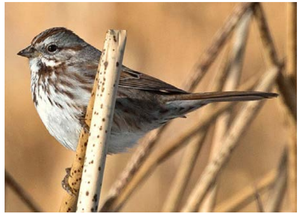
Figure 2. The numerous subspecies of Song Sparrow, including the breeding fallux of Arizona, are described in the book.

As a reference guide, this book superbly cites annotations for each species in the notes section at the back of the book. The index cites historical and modern ornithologists, as well as birds by name. For the sparrow enthusiast, the Peterson Reference Guide to Sparrows of North America is a complementary book, lush with information not easily or likely found in other resources. For an ornithological history buff, this book weaves tales of taxonomic discovery.