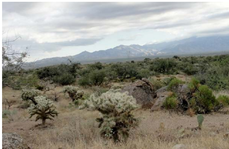
Figure 2: Area in Pinal Co. where Cassin's Sparrows were found singing and skylarking 2006-11.

Phillips et al. (1964) include a map that includes sites of wintering Cassin's Sparrow in the Willow Springs Road-Oracle area, but there are no documented reports during breeding season. The surveys during the Arizona Breeding Bird Atlas between 1993 and 2000 in that area didn't detect any Cassin's Sparrows, but these surveys were conducted in April and May before typical singing and other breeding behavior for this sparrow begins (Troy Corman, correspondence to the author, 12 July 2012).